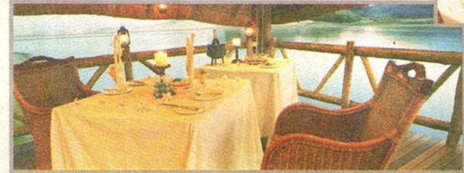
CLOCKWISE FROM LEFT: An intimate dinner for two at the Riverside Gazebo perched on the edge of the Umngazi River; aerial view of the Umngazi River Bungalows and Spa; one of the spa baths overlooking the bungalows; the luxury Ntabeni Spa Suite which has panoramic views of the Umngazi River Bungalows and the Wild Coast. It's fit for a king!